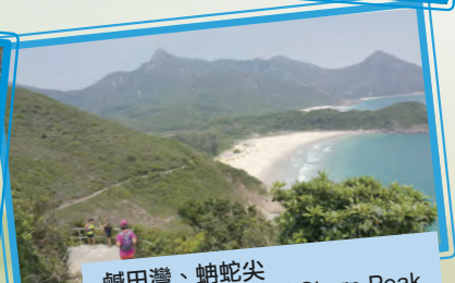
鹹田灣、蝮蛇尖 Ham Tin Wan and Sharp Peak