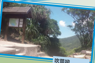
吹筒坳 Chui Tung Au