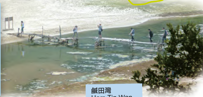
鹹田灣 Ham Tin Wan